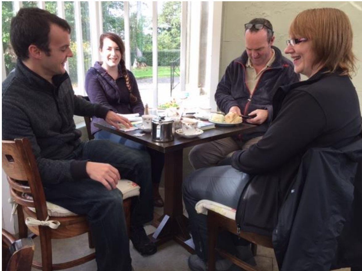
History & Heritage students on a field-trip to The Grove Museum of Victorian Life

The College's Student Welfare Officer provides support for a wide range of personal and financial issues and works with students on their personal development and self-management skills. This can help you with issues such as work-life balance, managing stress or anxiety, and financial budgeting.